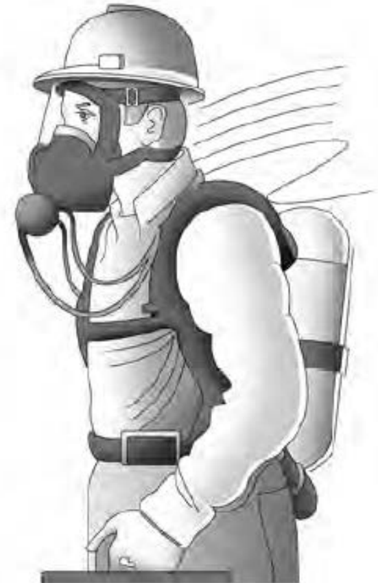
Full Facepiece Self-Contained Breathing Apparatus (SCBA) Pressure demand mode is APF=10,000 Needs to be fit tested